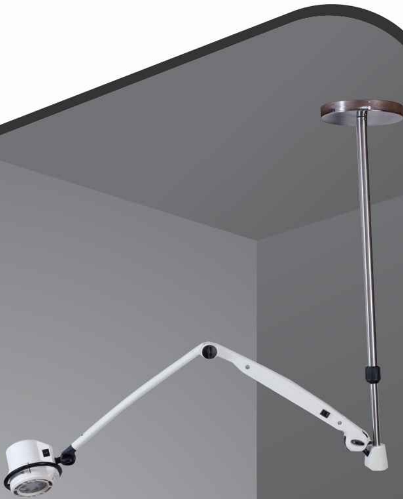
SPARX ELC002 Ceiling Model

SPACE SAVING 360 DEGREE ROTATION OF DOME COOL LIGHT HEIGHT ADJUSTABLE